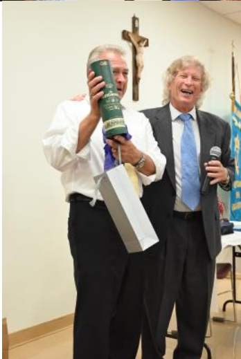
Family of the Year